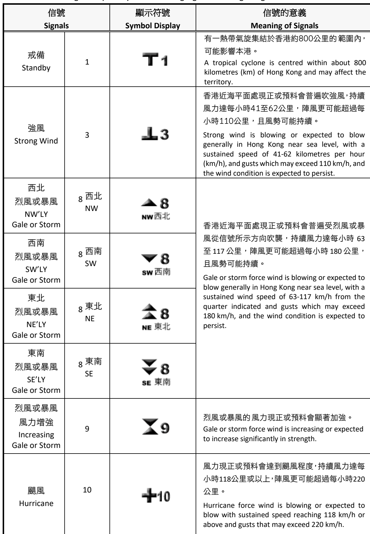
TABLE 1.4 Meaning of tropical cyclone warning signals in Hong Kong in 2021