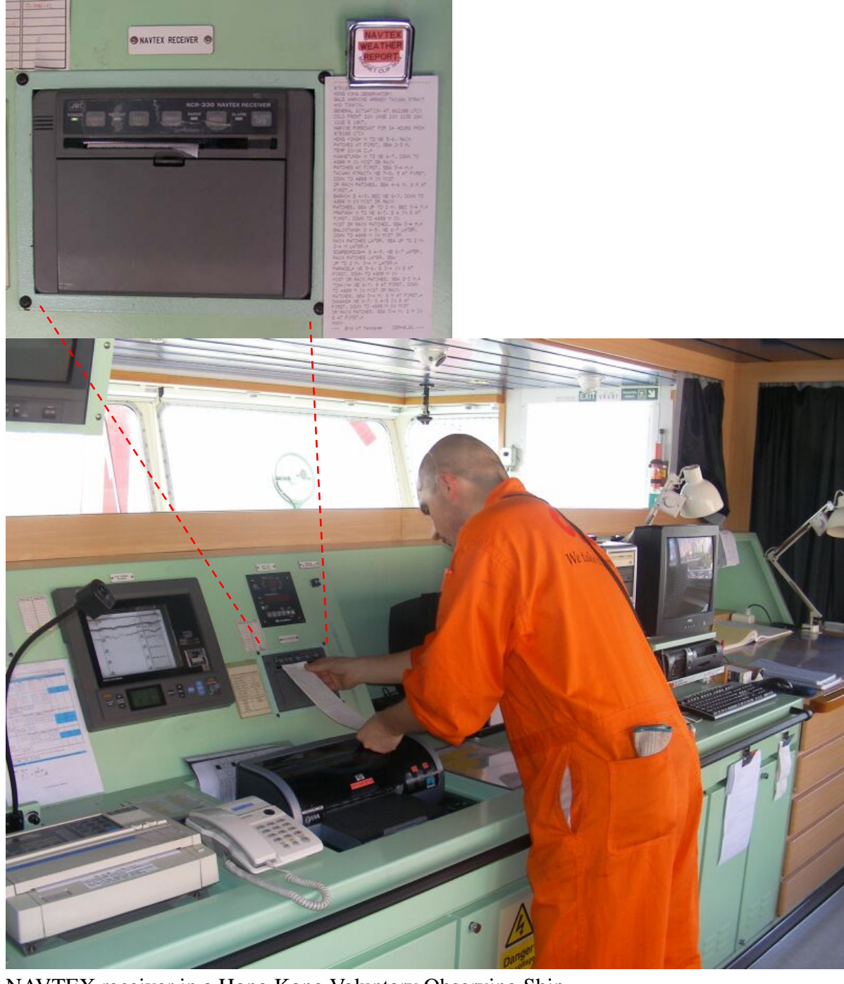
NAVTEX receiver in a Hong Kong Voluntary Observing Ship

Both the Marine Weather Forecast and the Tropical Cyclone Warning for Shipping are printed out automatically by means of narrow-band direct-printing telegraphy on the bridge of a ship through the on board NAVTEX receiver.