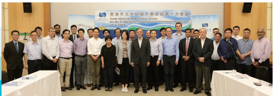
Participants of the 10th meeting of the Liaison Group for the Shipping Community