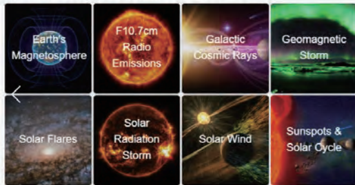
"Space Weather" webpage

Explore various space environments between the Sun and the Earth