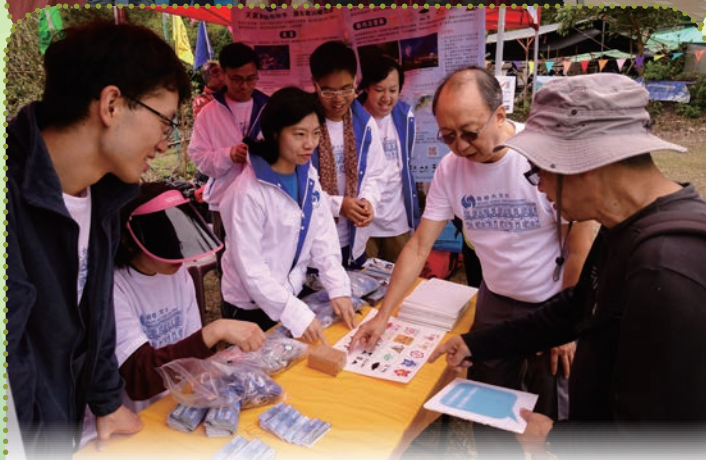
On 14 October 2018 and 6 January 2019, colleagues from the Observatory and Friends of the Observatory participated in the Mountaineering Safety Promotion Day 2018 organised by The Civil Aid Service (CAS), and the Cheung Sheung Hiking Day organised by the Hong Kong Hiking Association, China (HKHA China), respectively. Through exhibitions, games and talks, the activities introduced members of the public to the relationship between HKO services and hiking.