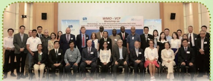
From 8 to 10 October 2018, the HKO hosted an international training workshop on Meteorology-Air Traffic Management (MET-ATM) integration, under the WMO's Voluntary Cooperation Programme (VCP). The workshop was attended by participants from 16 aviation weather services units based in locations spanning the world.