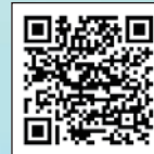
My Observatory (Android version):

Android users can download Dr. Tin WhatsApp stickers in the newest, Android version of the My Observatory mobile apps. The iOS version will follow soon.