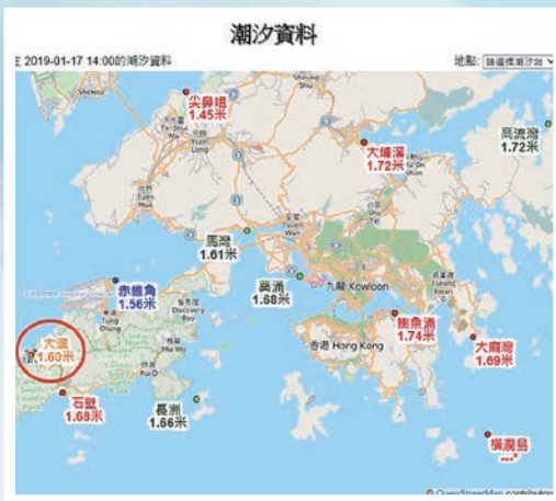
Tai O Tide Station has been added to the “Tidal Information” webpage

In September 2018, real-time tide measurements from the Tai O Tide Station, operated by the Drainage Services Department, were added to the “Tidal Information” webpage of the HKO, to enhance tidal information services and monitoring of tidal variations at various locations in Hong Kong. The Tidal Information service is available on the HKO website ( https://www.weather.gov.hk/tide/marine/realtide_uc.htm ), mobile website ( https://www.weather.gov.hk/m/rt_uc.htm ) and the My Observatory mobile apps.