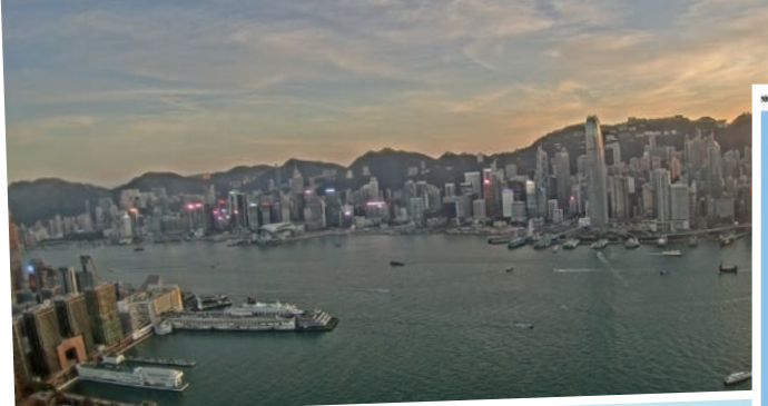
The HKO website now includes real-time weather photos captured at the International Commerce Centre (ICC) in West Kowloon

11.1 (7共和 13.6 (7共和 13.6 (7共和 13.6 (7共和 13.6 (7共和 13.6 (7共和 13.6 (7共和 13.6 (7共和 13.6 (7共和 13.6 (7共和 13.6 (7共和 13.6 (7共和 13.6 (7共和 13.6 (7共和 13.6 (7共和 13.6 (7共和 13.6 (7共和 13.6 (7共和 13.6 (7共和 13.6 (7共和 13.6 (7共和 13.6 (7共和 13.6 (7共和 13.6 (7共和 13.6 (7共和 13.6 (7共和 13.6 (7共和 13.6 (7共和 13.6 (7共和 13.6 (7共和 13.6 (7共和 13.6 (7共和 13.6 (7共和 13.6 (7共和 13.6 (7共和 13.6 (7共和 13.6 (7共和 13.6 (7共和 13.6 (7共和 13.6 (7共和 13.6 (7共和 13.6 (7共和 13.6 (7共和 13.6 (7共和 13.6 (7共和 13.6 (7共和 13.6 (7共和 13.6 (7共和 13.6 (7共和 13.6 (7共和 13.6 (7共和 13.6 (7共和 13.6 (7共和 13.6 (7共和 13.6 (7共和 13.6 (7共和 13.6 (7共和 13.6 (7共和 13.6 (7共和 13.6 (7共和 13.6 (7共和 13.6 (7共和 13.6 (7共和 13.6 (7共和 13.6 (7共和 13.6 (7共和 13.6 (7共和 13.6 (7共和 13.6 (7共和 13.6 (7共和 13.6 (7共和 13.6 (7共和 13.6 (7共和 13.6 (7共和 13.6 (7共和 13.6 (7共和 13.6 (7共和 13.6 (7共和 13.6 (7共和 13.6 (7共和 13.6 (7共和 13.6 (7共和 13.6 (7))))))))))))