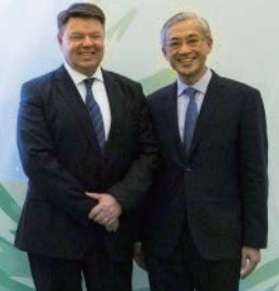
Opening ceremony of the Regional Specialized Meteorological Centre (RSMC) for Nowcasting.