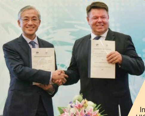
The two parties signed a MoU to further strengthen meteorological co-operation.

In June this year, the HKO was designated as an RSMC for Nowcasting for the Asian region. The HKO will provide meteorological organisations in the region with products and techniques related to nowcasting of high-impact weather events.