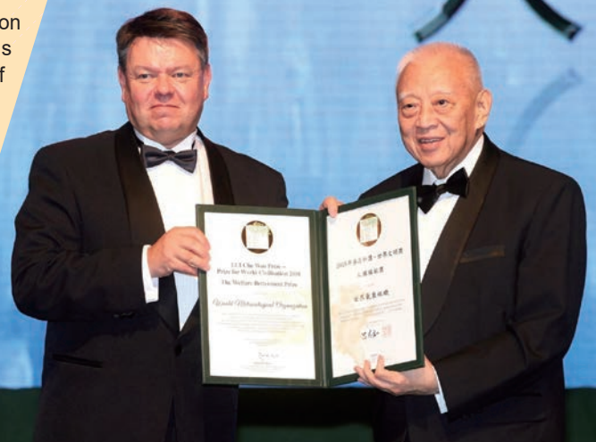
Professor Petteri Taalas received the LUI Che Woo Prize-Prize for World Civilization "Welfare Betterment Prize" from the award presenter, Mr Tung Chee-hwa.

The Chief Executive, Mrs Carrie Lam, attended the ceremony, and delivered a speech commending the WMO for its significant contributions to responding to the effects of potentially disastrous weather and mitigating global climate change. In addition, she appreciated the advance warnings, preparations and defensive measures in response to Super Typhoon Mangkhut by various government departments, including the Observatory, to minimise the impact of the tropical cyclone on Hong Kong.