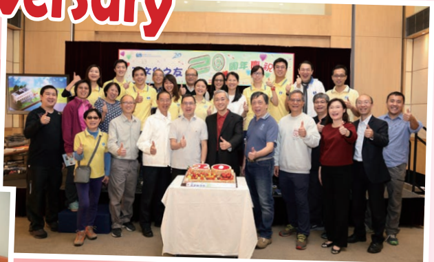
Happy moment during the 20th Anniversary Celebration Party.