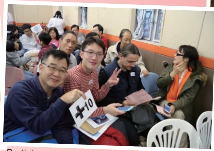
Participants preparing the weather report for the group games at the Stargazing Evening Camp.