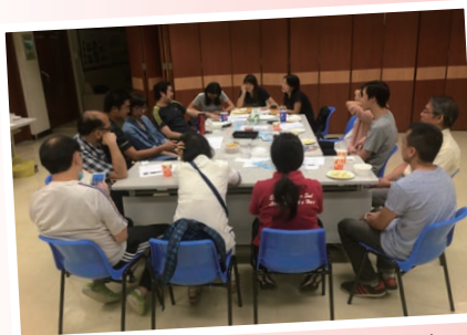
Friends of the Observatory committee members discussing event arrangements and preparations.