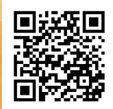
The award-winning images