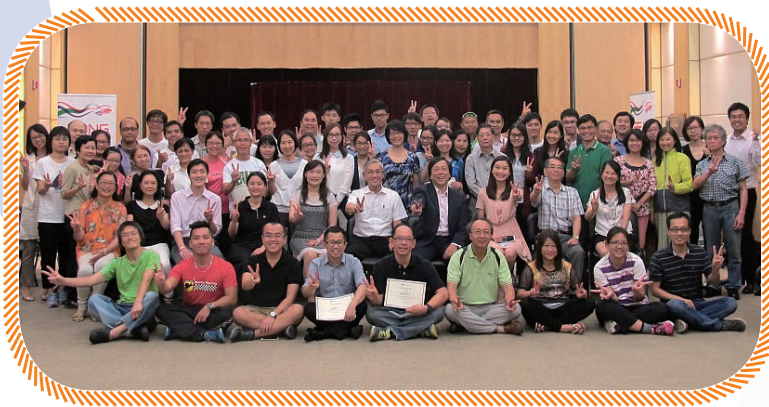
On 16 June, the Director of the Observatory hosted a dinner gathering for 80 Friends of the Observatory volunteers to thank them for their support on the Observatory's 2015 Open Day. Certificates of merits for outstanding docents and volunteers in 2014 were also presented at the event.