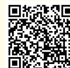
"Fallstreak Hole", Cool Met Stuff

On 19 January, a fallstreak hole appeared in the sky over Hong Kong as a band of altocumulus clouds passed by in the morning. What is a fallstreak hole? Altocumulus or cirrocumulus clouds contain water droplets that, despite circulating at sub-zero temperatures, remain unfrozen. Even a slight disturbance in the surrounding air current, for example when an aeroplane flies past, can cause the droplets to become ice crystals, and when these crystals fall they leave behind a fallstreak hole.