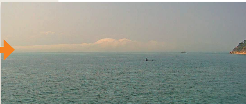
Sea fog (indicated by an arrow) near Hei Ling Chau to the east of Lantau Island captured by the weather camera facing northwest from Yung Shue Wan Pier on Lamma Island in the afternoon of 19 March.

The Hong Kong Observatory has enhanced its regional weather information service by adding real-time weather photos taken on Lamma Island to its website. A new camera has been set up at Yung Shue Wan Pier overlooking the West Lamma Channel to the east of Lantau Island. Members of the public can access the weather photos on the Observatory's Regional Weather in Hong Kong webpage ( www.hko.gov.hk/wxinfo/ts/index_e_webcam.htm ) and mobile platform webpage ( m.hko.gov.hk/wxreport/wxphoto.htm ).