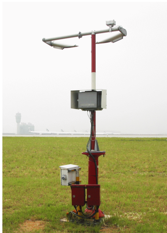
Figure 2 A forward scatter meter on HKIA