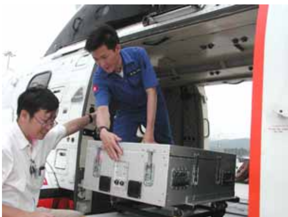
Observatory staff installing the aerial radiation monitoring system onboard a Government Flying Service’s helicopter

In the event of an emergency at the nuclear power stations at Daya Bay, the Observatory will immediately intensify radiation monitoring, assess the radiological consequences and provide advice to the government regarding the appropriate protective actions to take.