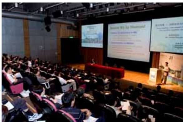
Symposium on “Science in the Public Service”

The Observatory promotes public awareness of and community preparedness on natural disasters by regularly conducting public talks, providing media interviews, organizing training courses as well as producing publicity materials on hazardous weather phenomena.