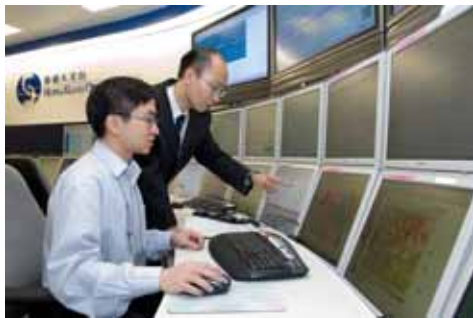
Hong Kong Meteorological Centre

Weather Services: The Observatory provides weather services to the public, fishermen, shipping community, special users, as well as the aviation sector. It also provides tailor-made weather service for major local events, including the 2008 Olympic equestrian event in Hong Kong.