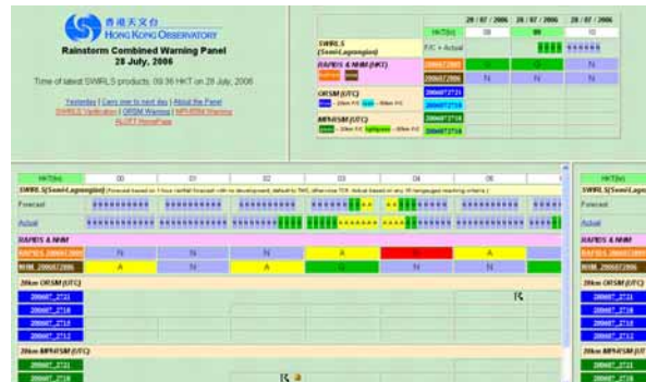
Rainstorm combined warning panel

and the western North Pacific, and uses that as a basis for forecasting the weather in Hong Kong and the adjacent seas. The Observatory has developed and is operating a nowcasting system called SWIRLS (Short-range Warning of Intense Rainstorms in Localized Systems) to predict rapidly developing rainstorms. Using radar and raingauge data, SWIRLS provides a forecast of the rainfall distribution over Hong Kong up to 3 hours ahead. The forecast is updated every six minutes to support the issuance of warnings for heavy rain in Hong Kong. SWIRLS was also deployed to Beijing to support the local weather service during the 2008 Beijing Olympics.