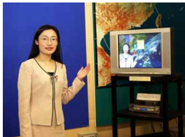
Television weather programme production and presentation by professional meteorologist of the Observatory

Weather information, forecasts and warnings on hazardous weather for the public are issued and broadcast through a variety of dissemination channels, including the Observatory's website ( http://www.weather.gov.hk/ and http://www.hko.gov.hk/ ), the 187 8200 Dial-a-weather service, press, radio and television stations. Television weather programmes are produced and presented daily by professional meteorologists of the Observatory for television broadcast. Through radio interviews, Weather Service Officers of the Observatory provide the public with the latest weather situation for making appropriate preparation before they set off for work or school in the morning.