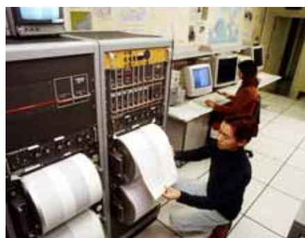
Analysis of seismograms by Observatory staff

A network of tide gauges operated by the Observatory provides information on tides, mean sea levels and storm surges.