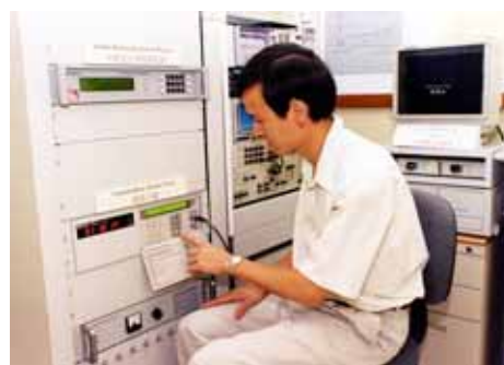
Observatory staff inspecting the operation of the caesium beam atomic clock

The Observatory maintains a caesium atomic beam clock as the Hong Kong time standard. Time checking services are provided through the Internet, the Dial-a-weather System and local radio stations. The Observatory uses a high accuracy time transfer system based on the Global Positioning System to provide time information of its atomic clock to the International Bureau of Weights and Measures (BIPM) in France, thereby contributing to the determination of the co-ordinated universal time (UTC).